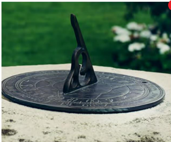
Figure 3 represents the Acáz sundial, which was an instrument used to measure time directly related to the Sun. As the hours passed, the shadow ran through the time marks that indicated the project of rescue as a sign asked by the king, retrieving 10 degrees, which is equivalent to 40 minutes.

Whereas in the time of man (Chronos) there is a series of things that are impossible and limited, in God's timing (Kairos) everything is possible.